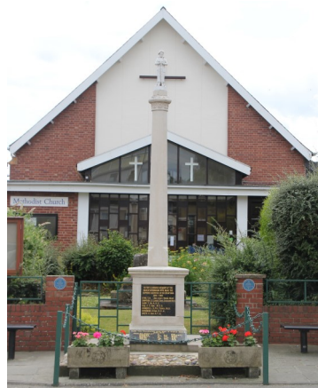
Blue Plaques at War Memorial

We need more people if we are to bring all our ideas to fruition - please become one of them and volunteer now!